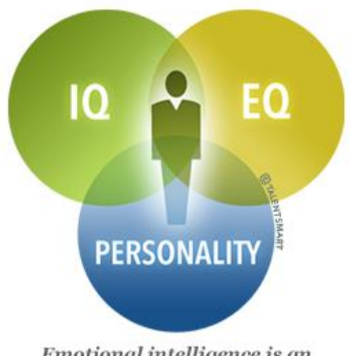
Emotional intelligence is an essential part of the whole person.

Emotional intelligence taps into a fundamental element of human behavior that is distinct from your intellect. There is no known connection between IQ and emotional intelligence; you simply can't predict emotional intelligence based on how smart someone is. Intelligence is your ability to learn, and it's the same at age 15 as it is at age 50. Emotional intelligence, on the other hand, is a flexible set of skills that can be acquired and improved with practice. Although some people are naturally more emotionally intelligent than others, you can develop high emotional intelligence even if you aren't born with it.